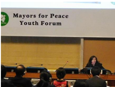
Presentation by a youth from a member city at the Mayors for Peace Youth Forum held in UNOG (April 2018, Geneva)